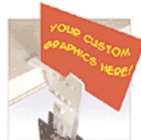
2-sided Strip Merchandisers with Graphics