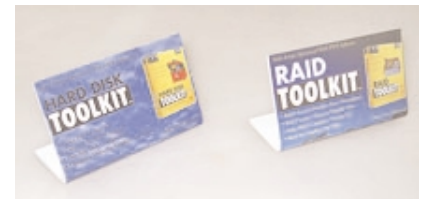
Freestanding Counter Graphics